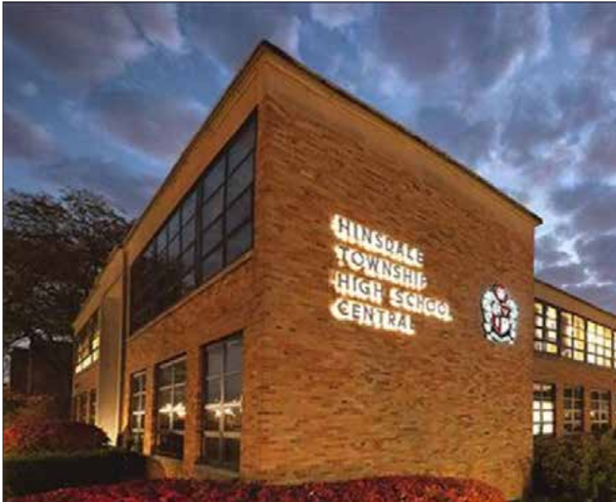
Hinsdale Township High School District 86's Central High School.

Analysis: 52 Hinsdale school retirees saved $5.4 million, will collect $65.7 million in retirement. Page 8